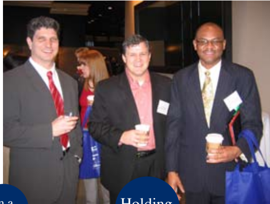
Holding a Bag