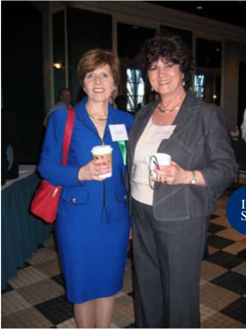
In a Suit