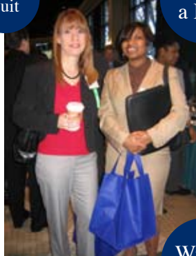
With a Cup